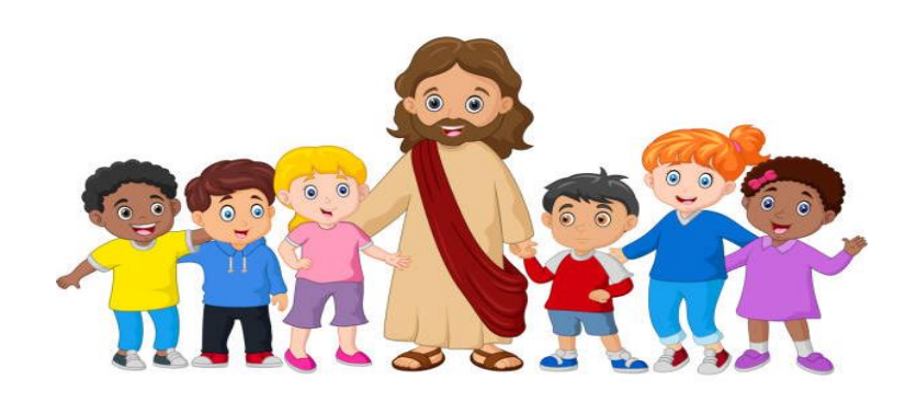
First Eucharist Sacrament

It is with great pleasure that we welcome you to celebrate our Kinder & Year 6 Buddy Mass on Monday, the 9th May @ 9:30am St Cecilia's Church, 23 Byron Street, Wyong